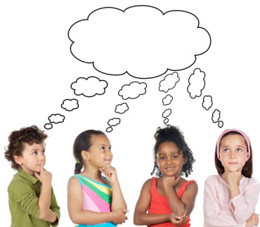
Philosophy for Children