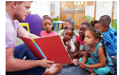
Reading to support writing