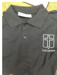
Navy T-shirt with Les Landes crest Navy shorts

In addition to the t-shirt and shorts they will need to wear plain trainers and the school tracksuit.