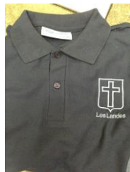
Navy T-shirt with Les Landes crest Navy shorts

In addition to the t-shirt and shorts they will need to wear plain trainers and the school tracksuit.